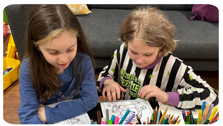
The Kids Who Care and teen programs continued to grow -- a lot! The program served 146% more youth and families in 2023.