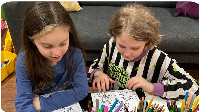
The Kids Who Care and teen programs continued to grow -- a lot! The program served 146% more youth and families in 2023.